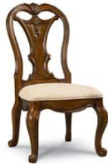
73204 SPLAT BACK SIDE CHAIR