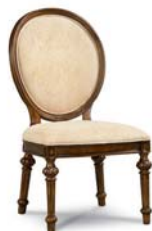
73206 UPHOLSTERED SIDE CHAIR