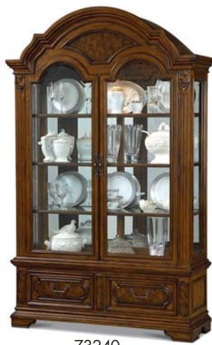
73240 CURIO CHINA