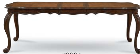
73221 RECTANGULAR LEG DINING TABLE (WITH TWO 18" LEAVES)