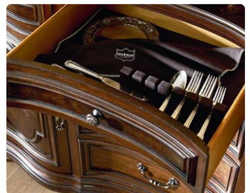
The top center drawer on the china base features a Guardian anti-tarnish felt-lined silverware tray.