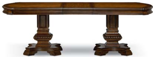
73220 DOUBLE PEDESTAL DINING TABLE (WITH TWO 18" LEAVES)