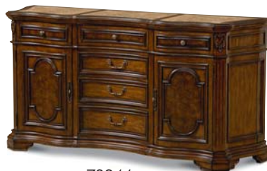
73244 BUFFET WITH STONE TOP