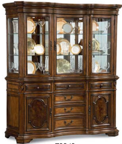
73243 CHINA BASE