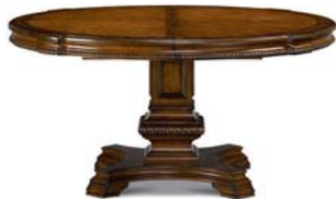
73225 SINGLE PEDESTAL TABLE (WITH ONE 18" LEAF)