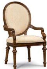
73207 UPHOLSTERED ARM CHAIR