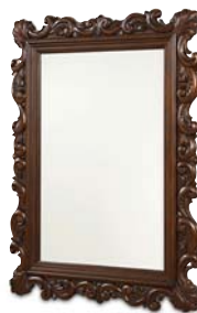
73255 CARVED MIRROR