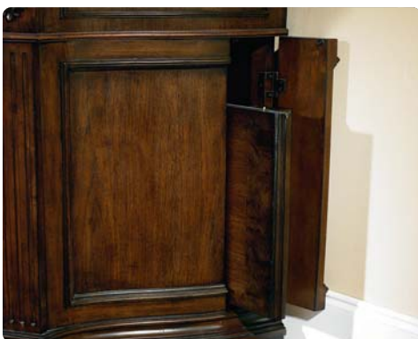
Hidden leaf storage on the side of the china base is accessed by a touch-latch door.