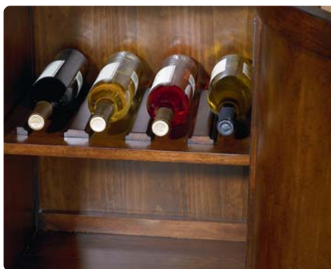
Adjustable shelves serve a dual function in the china base as wine bottle storage or shelf storage on opposite side.