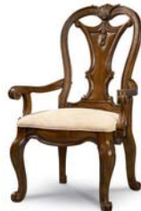
73205 SPLAT BACK ARM CHAIR